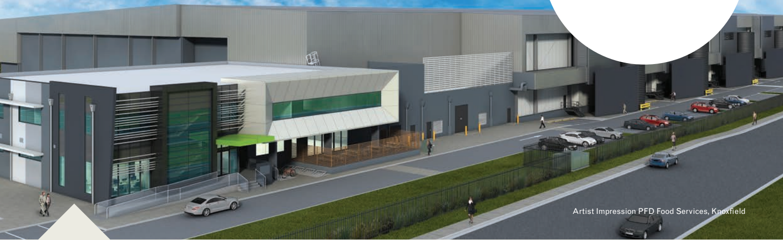
Artist Impression PFD Food Services, Knoxfield

A ustralian owned industry heavy weight PFD Food Services, are expanding operations with a new distribution facility in Melbourne's East.