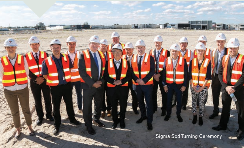
Sigma Sod Turning Ceremony

This new project is expected due for completion in early 2018.