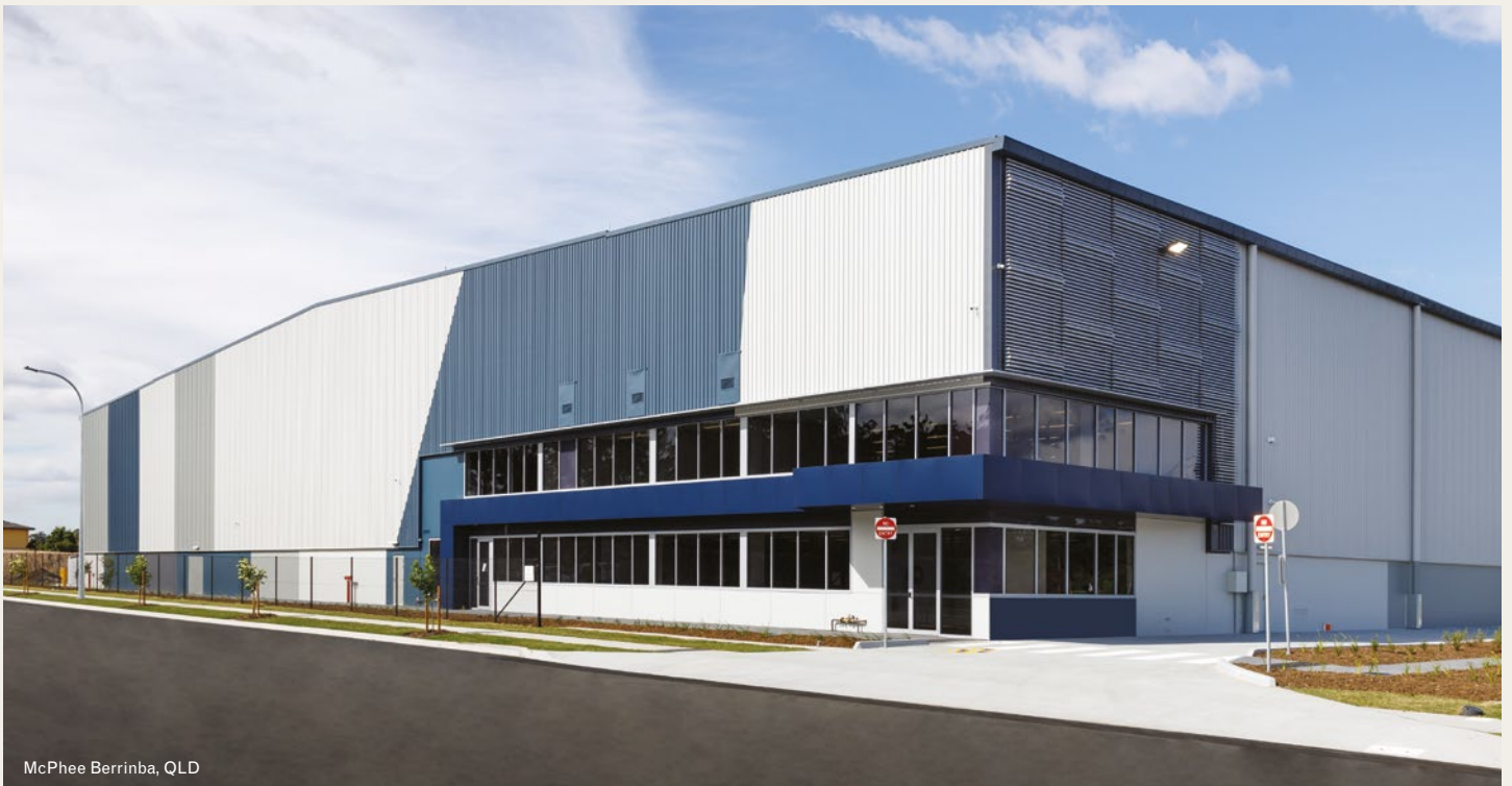
McPhee Berrinba, QLD